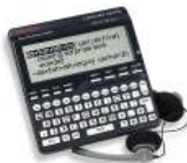
The Speaking Language Master Special Edition

The Speaking Language Master Special Edition (model #LM-6000SEV) comes with headphones, a soft, zippered pouch, AC adapter and instructions on an audio CD.