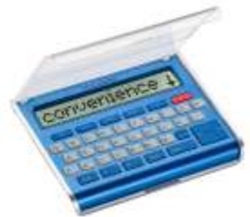
The NEW Spelling Ace® Spelling Corrector & Thesaurus

At just $19.95, the Spelling Ace is an affordable way to provide additional assistance for any student, especially students with dyslexia or other learning disabilities who need extra assistance with spelling.